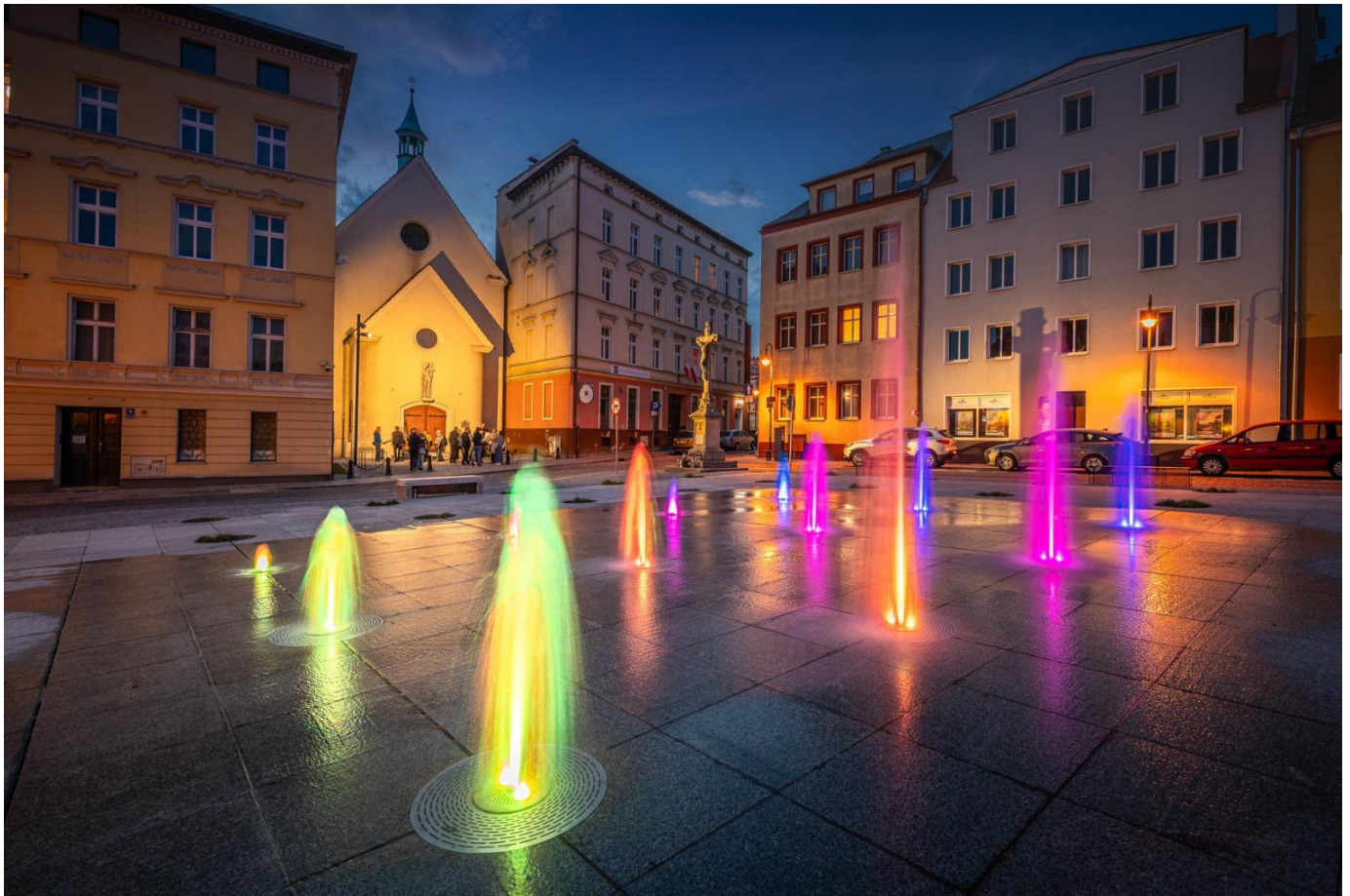
12. The unusual aerial panorama of Opole delighted with its colors.