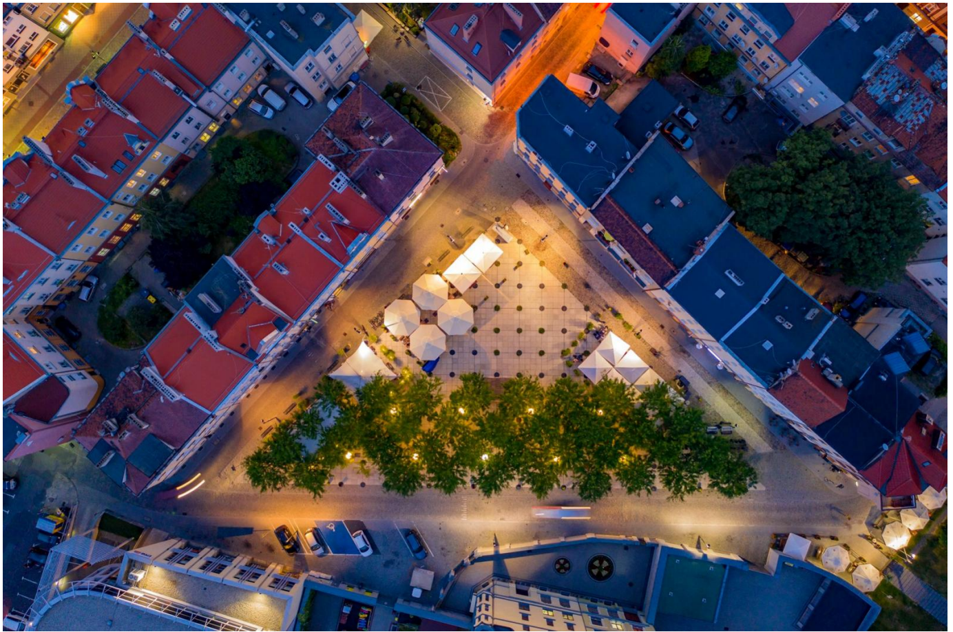
16. Beachgoers basking in the Bolko Bathing Area.