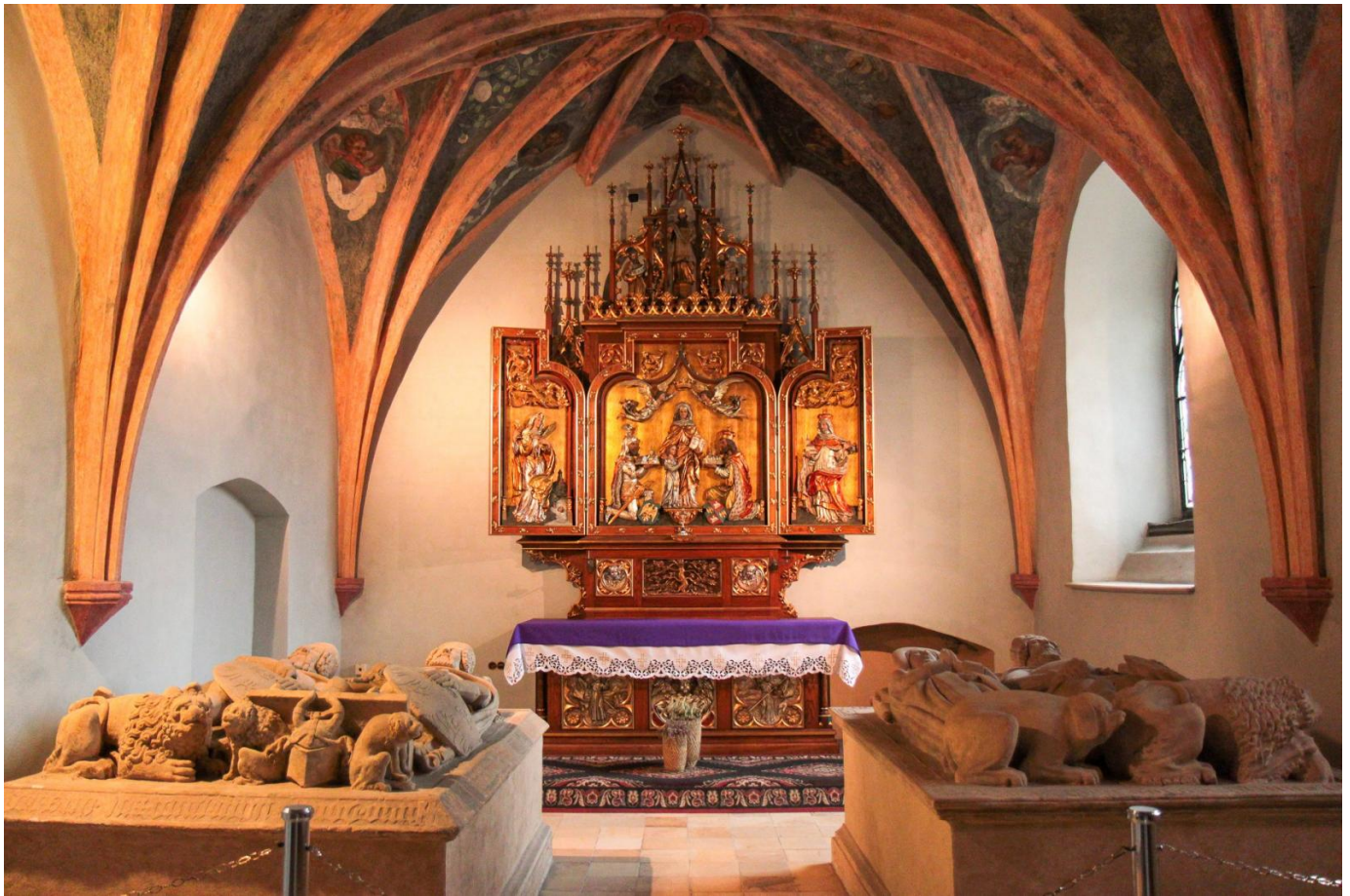
11. The colorful fountain in Saint Sebastian's Square is impressive.