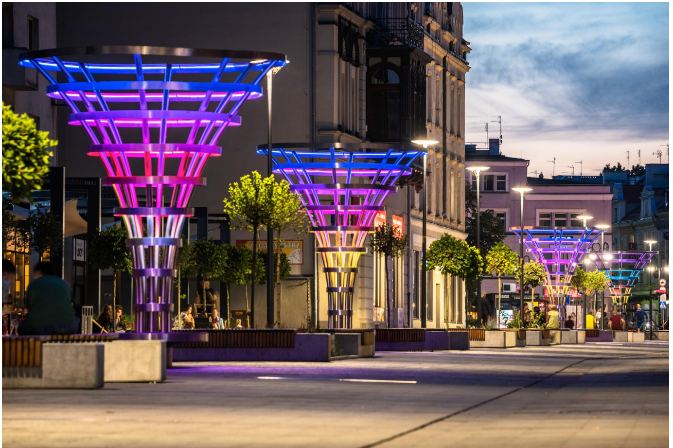
20. Amphitheater during the National Festival of Polish Song.