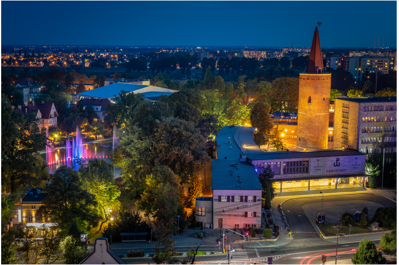
14. A traveling apiary on the roof of one of the tenement houses in the Old Town.