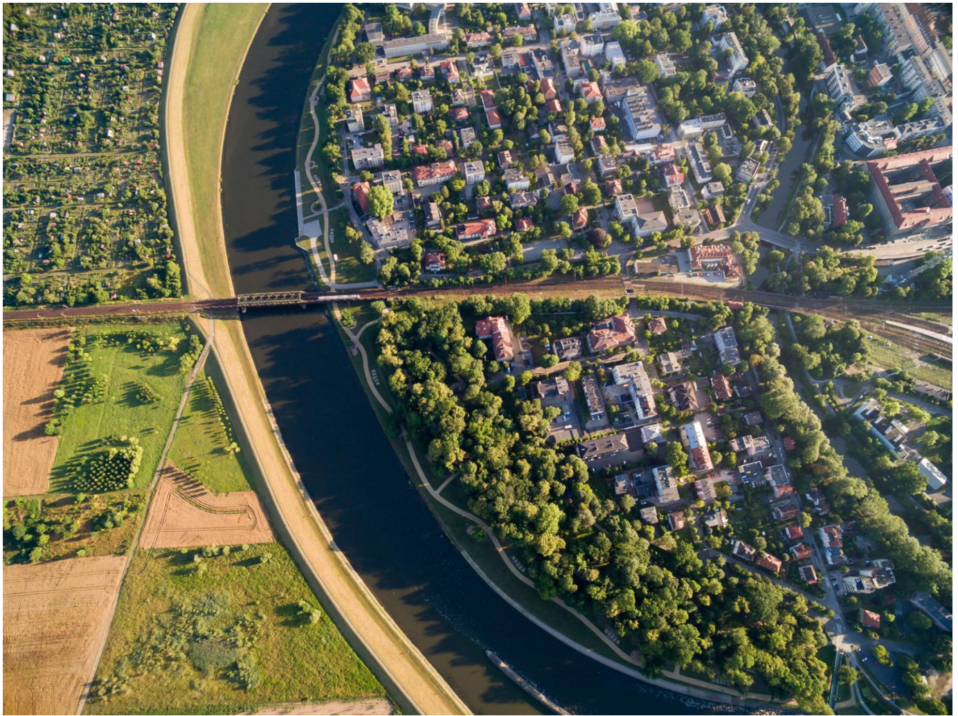
3. The old town looks exceptionally beautiful from the perspective of the Odra River.