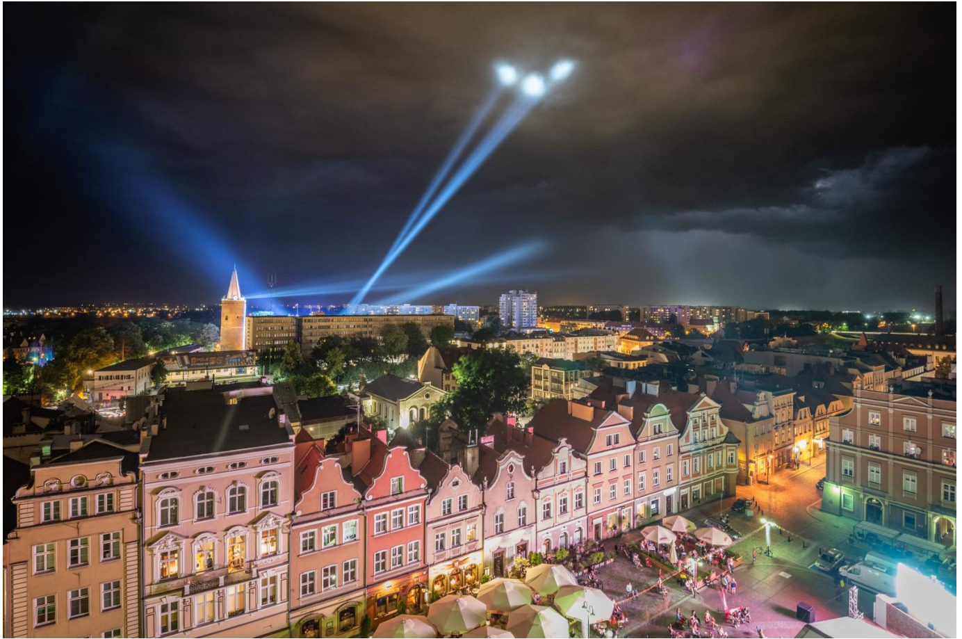
9. You liked the Market Square during the Christmas Market.