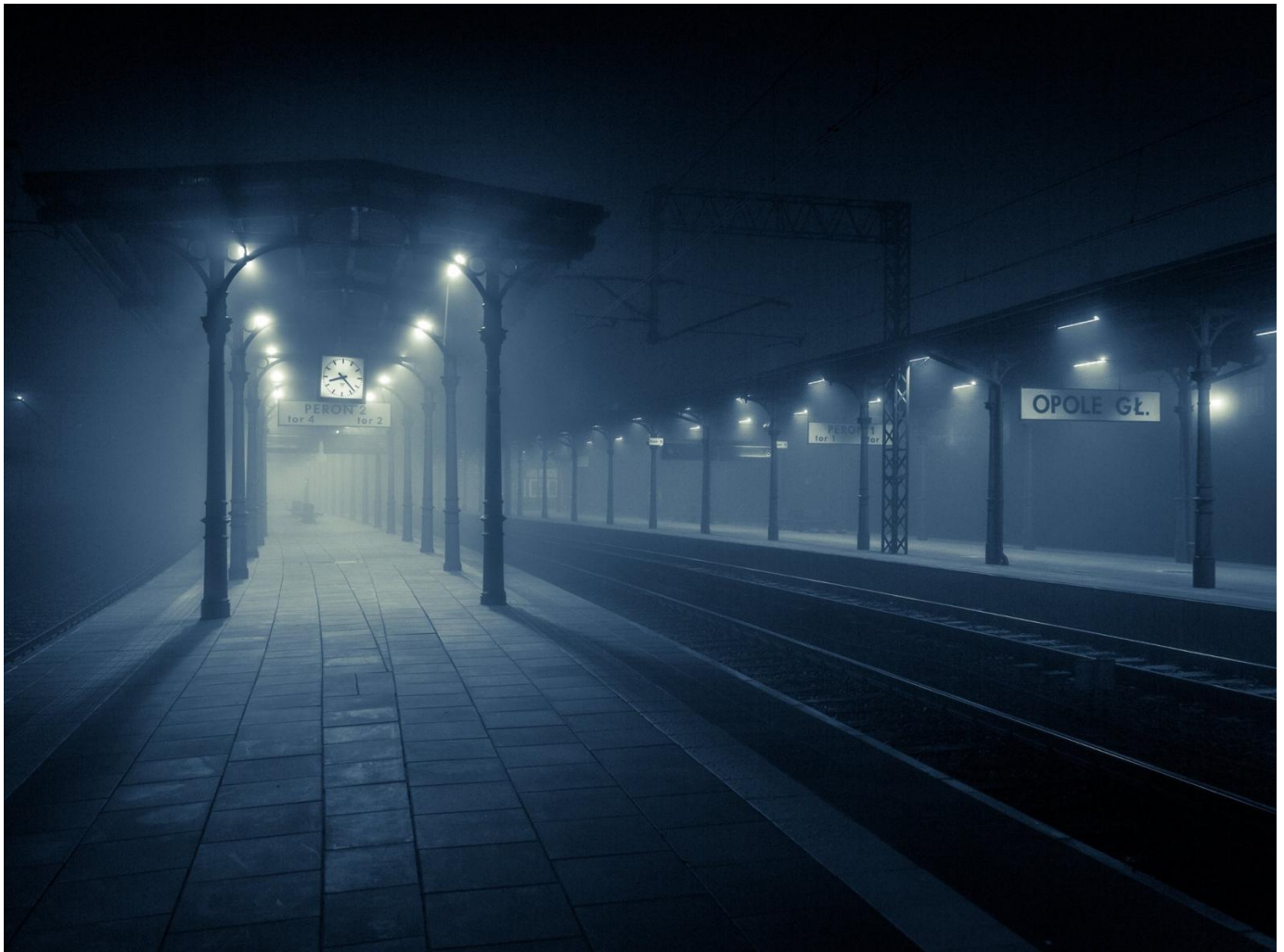
6. The idyllic atmosphere of the Opole Village Museum.