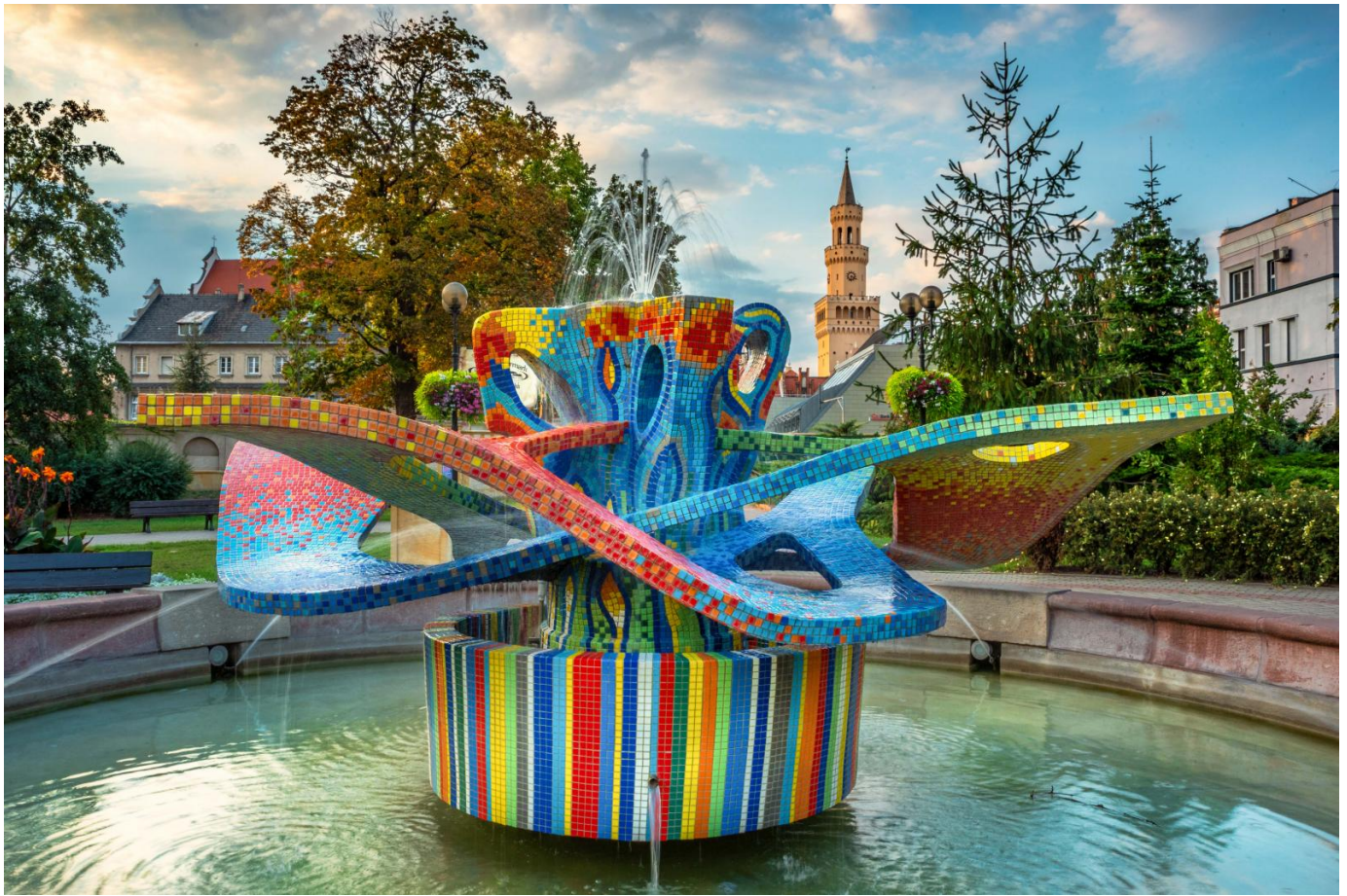
2. The bird's eye view of the Pasięka Island was positively received.