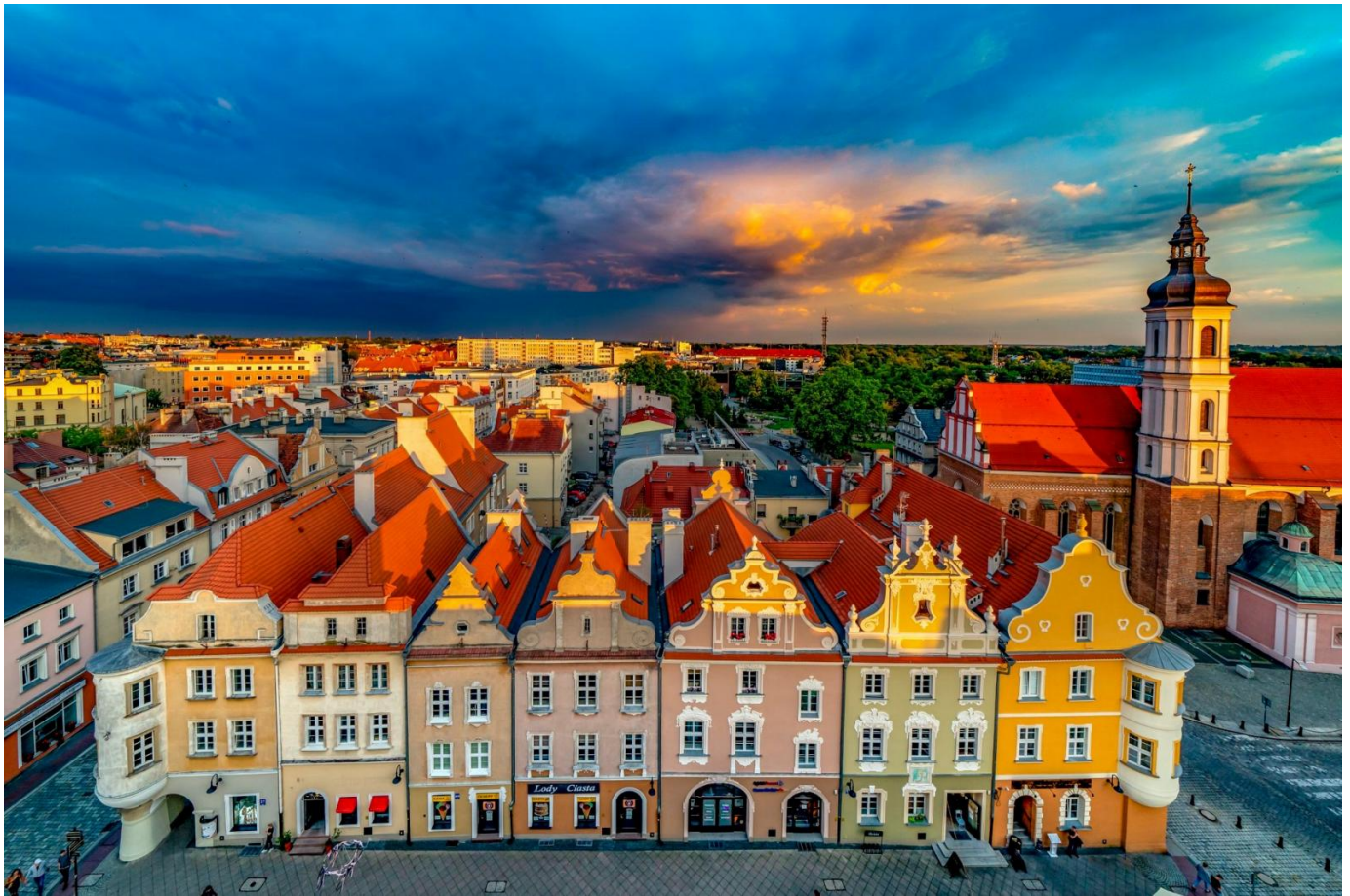
19. You were impressed by the colorful trumpets on Krakowska Street.