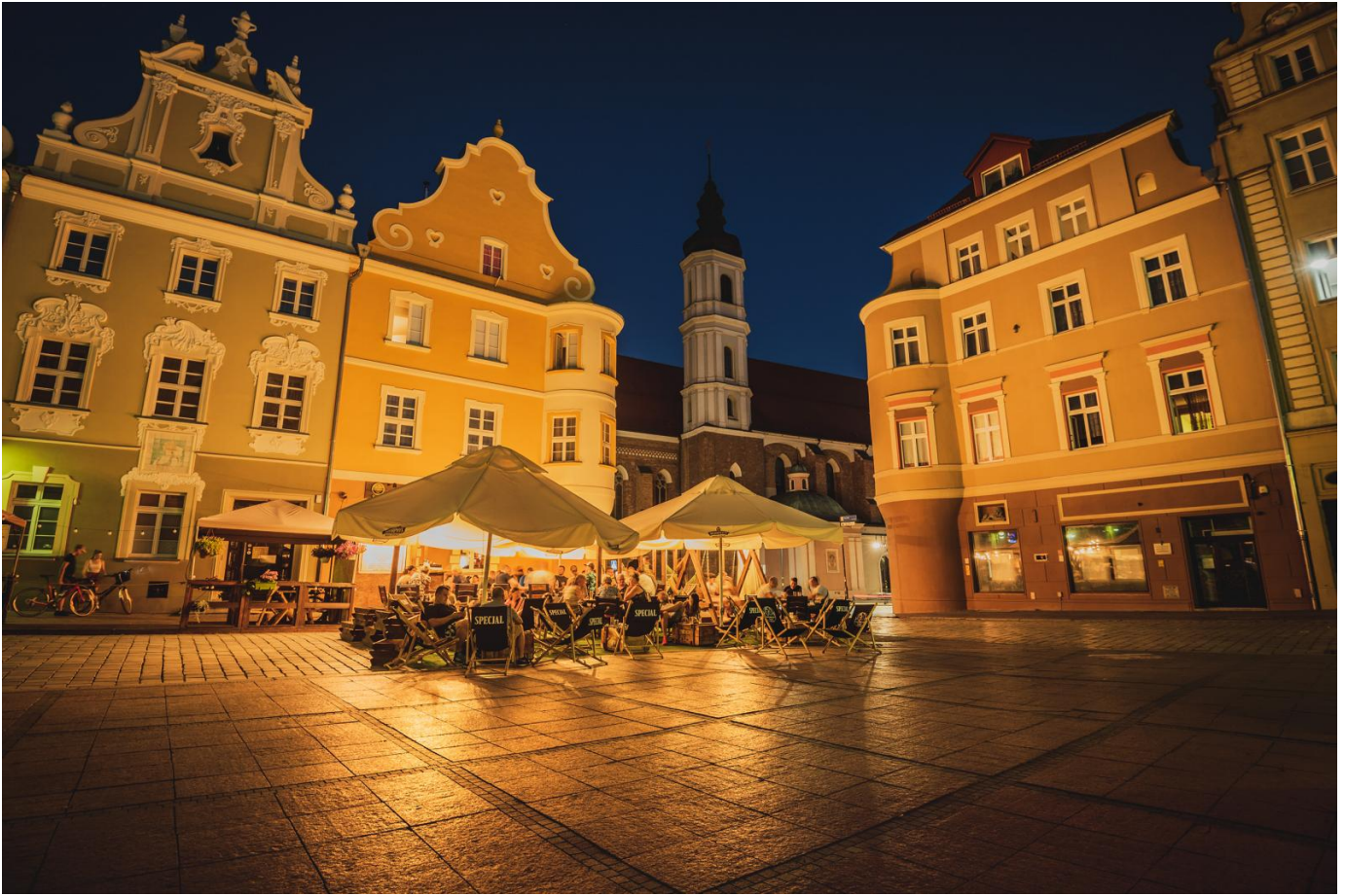
5. It's not Hogwarts. This is the Opole Main station.