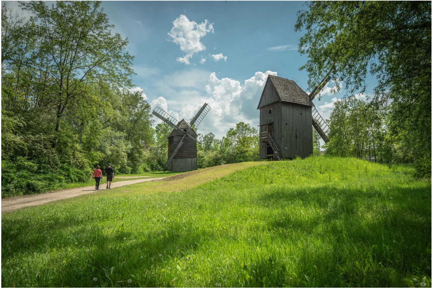
7. The hill in the Park at Osiedle Armii Krajowej like a stairway to heaven.