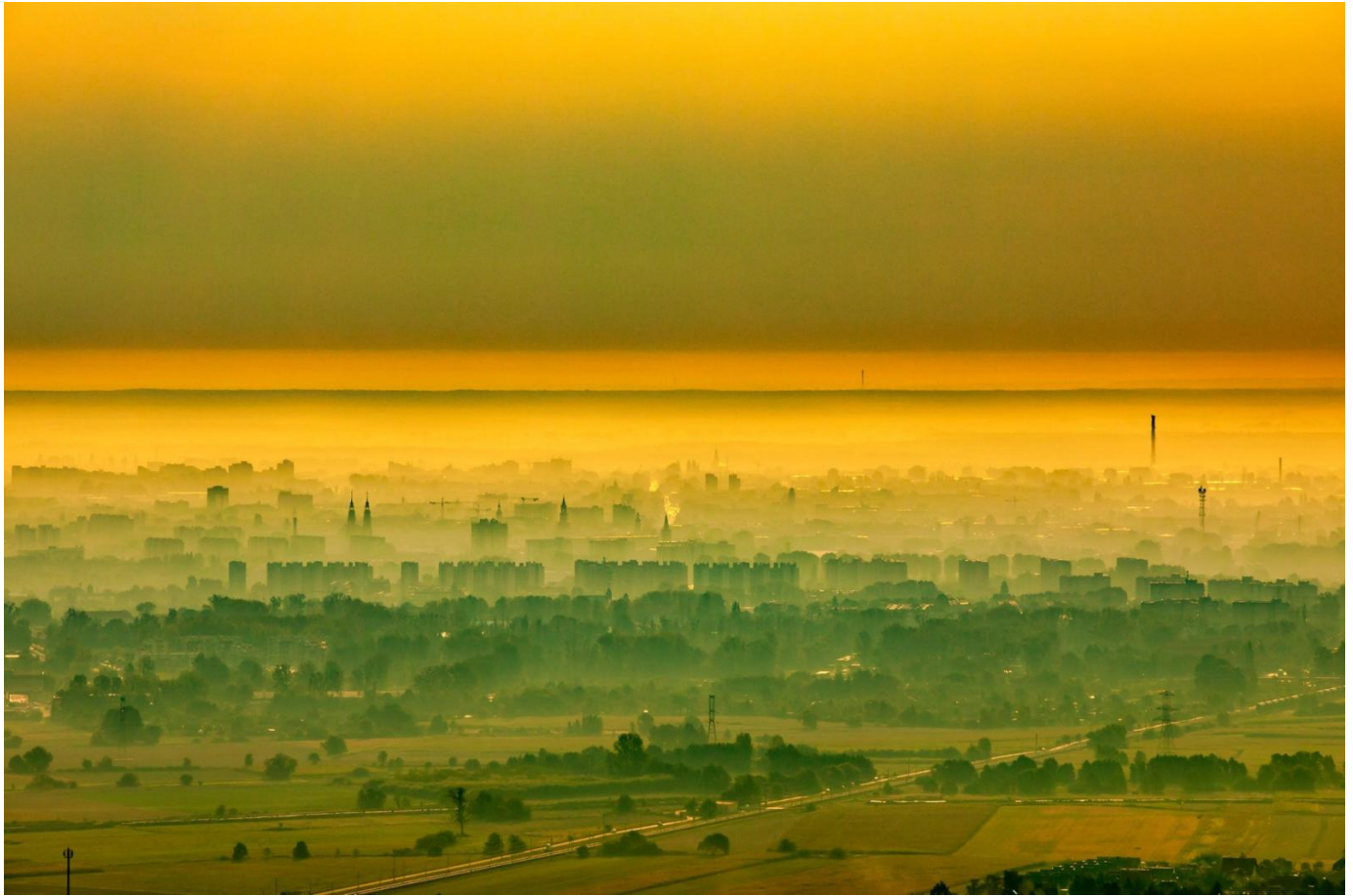
13. A beautiful view towards the Piast Tower and the Castle Pond.