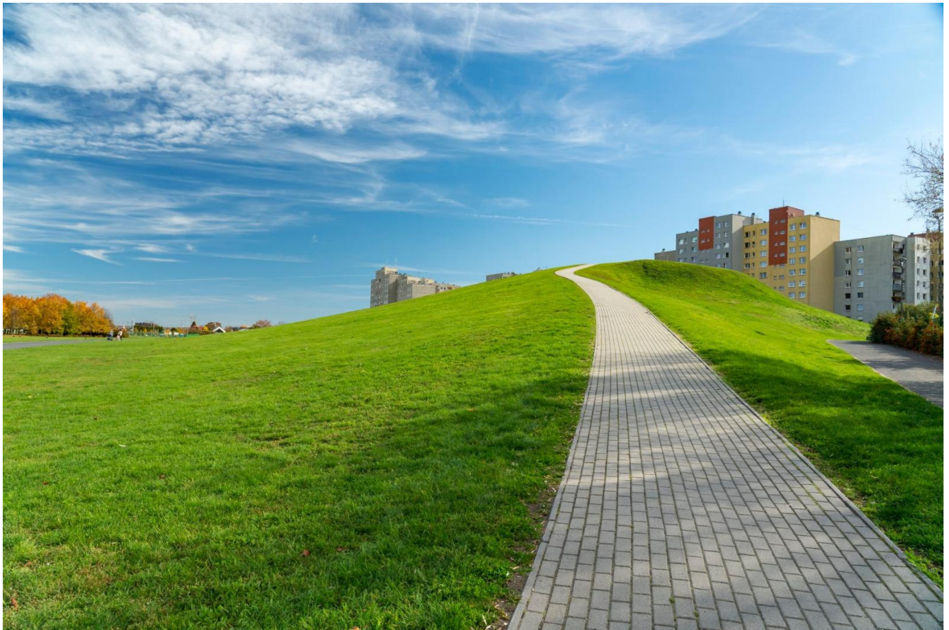
8. Picturesque Opole during the National Festival of Polish Song.