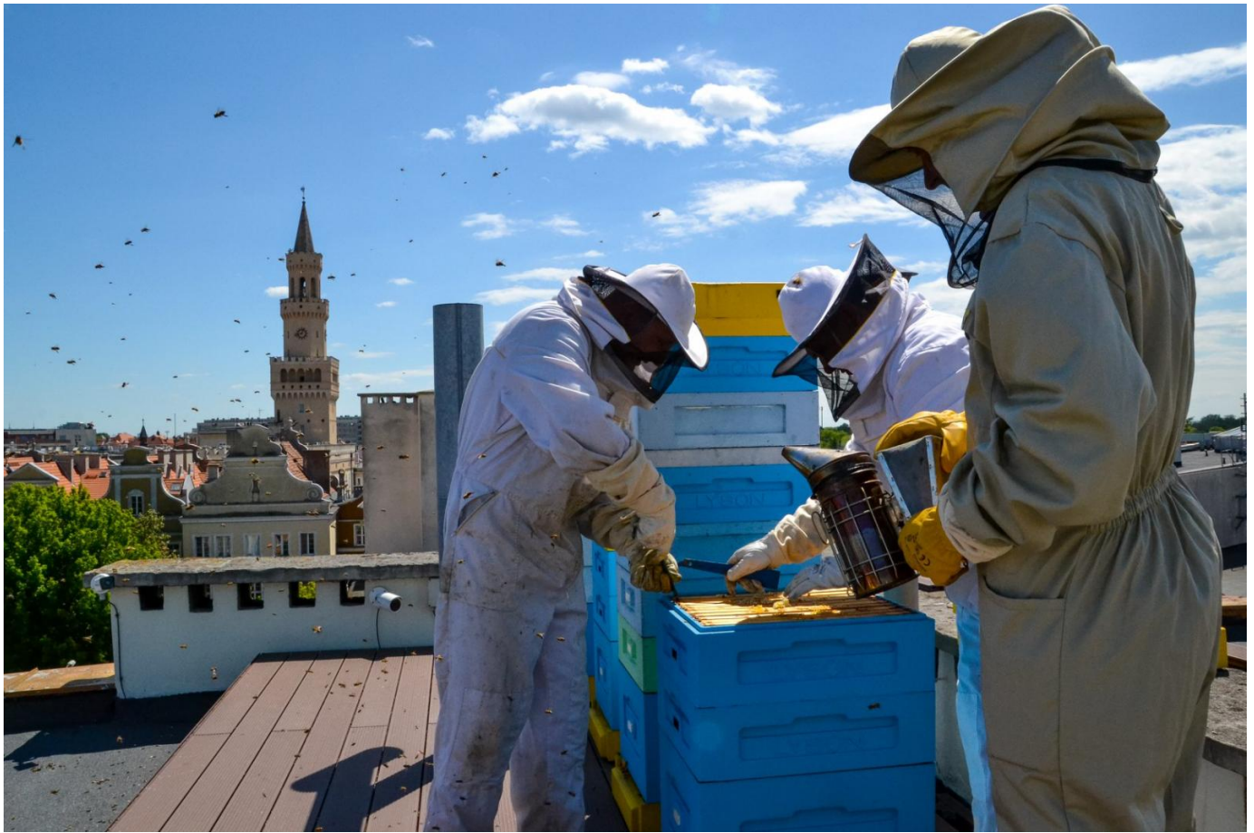
15. You were delighted with the greenery in the Mały Rynek.