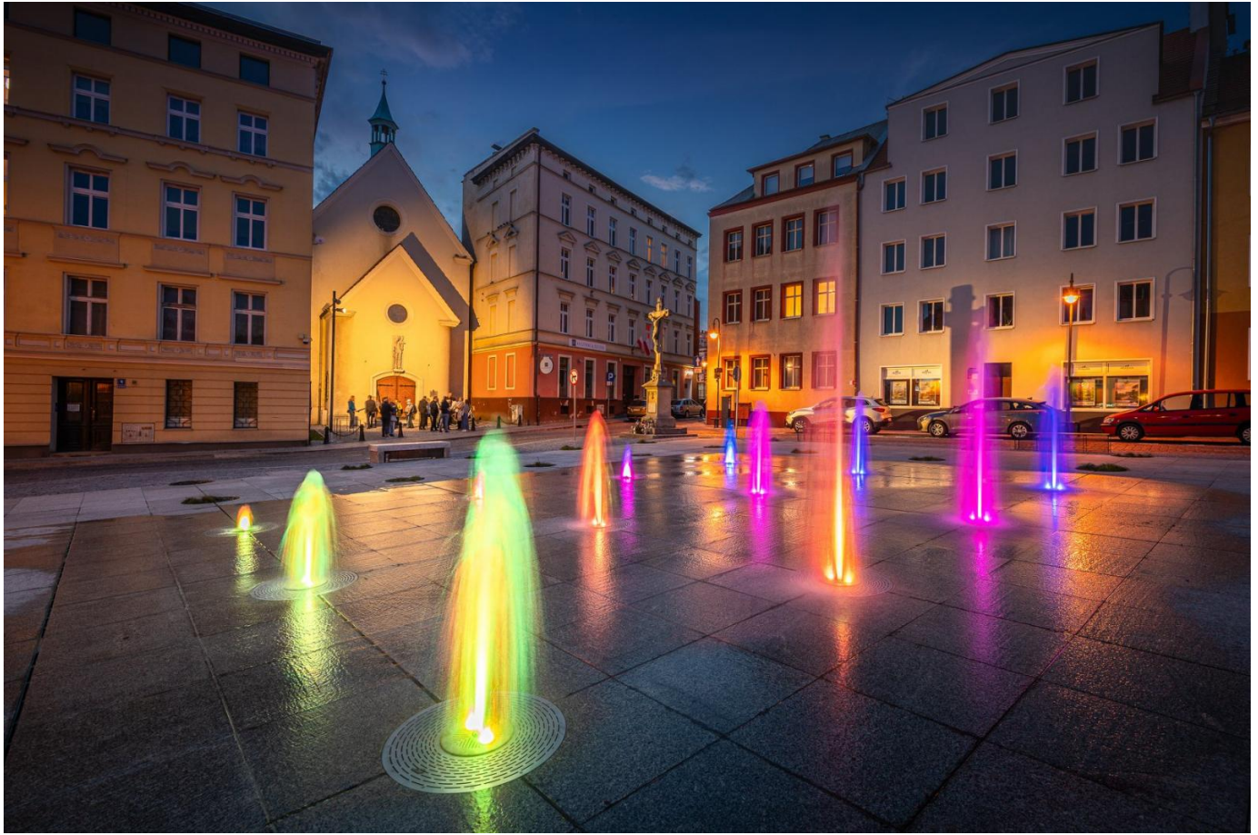
12. The unusual aerial panorama of Opole delighted with its colors.