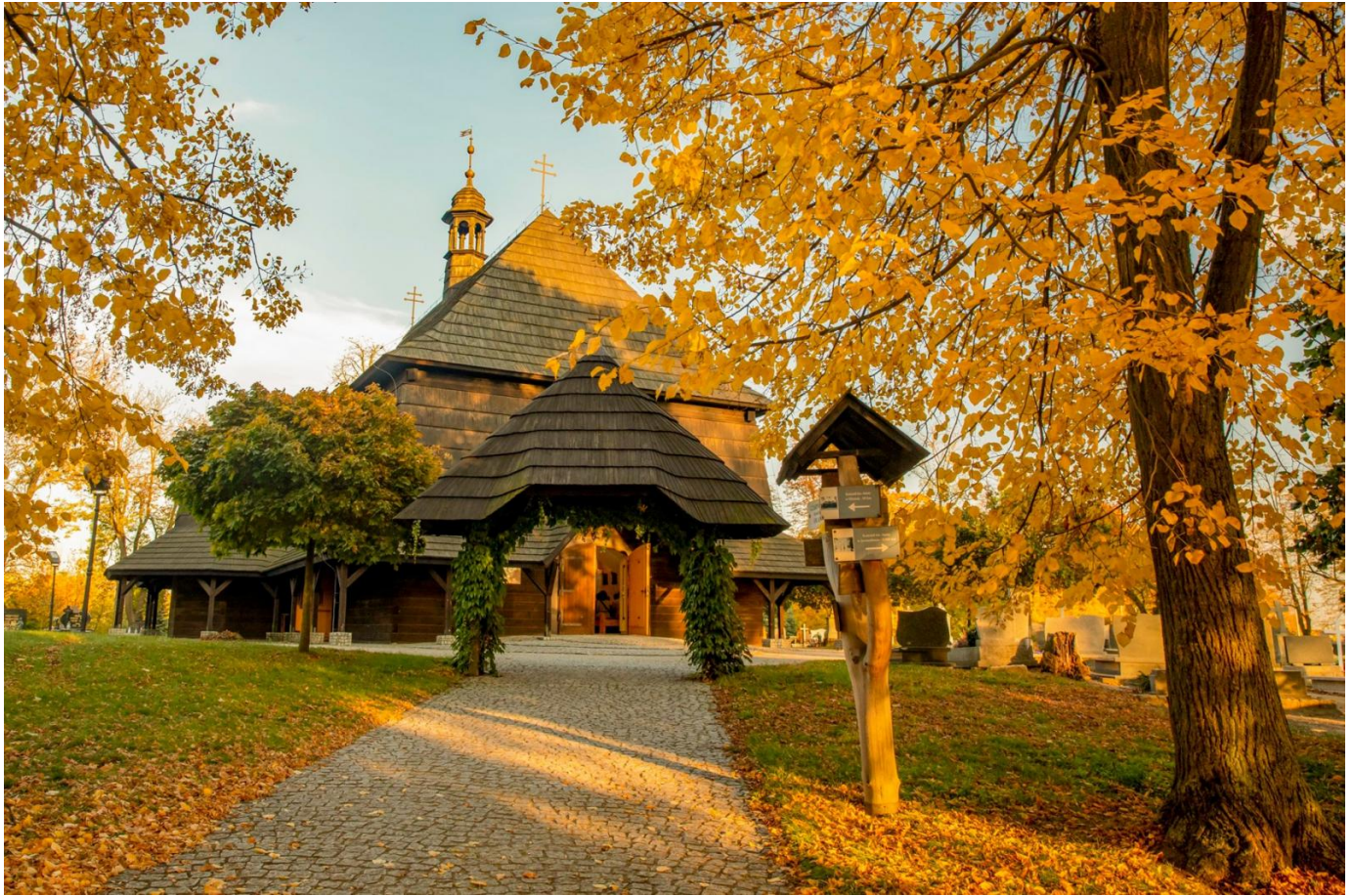
18. The southern frontage of the Market Square in all its glory.